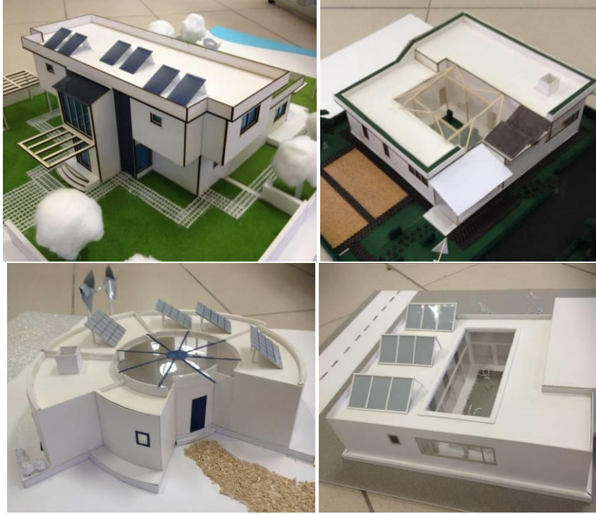
Figure 1: Models of the final house projects, test group students (Upper Left: Berkay Firat, Upper Right: İbrahim Nalbantoglu, Bottom Left: Seyma Hancer, Bottom Right: Sena Hardal)